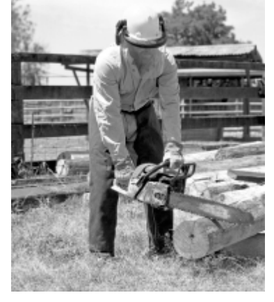
Figure 3. Chainsaw operator wearing appropriate PPE.

The control of exposure to plant risks should be secured by one or more measures other than provision of personal protective equipment. Use of PPE is the least effective method of controlling risk. However, a long-term strategy using other measures may require the short-term use of personal protective equipment to attain this aim. For example, you may decide to replace noisy rural plant with a quiet version. In the meantime, hearing protection is provided to workers exposed to the noisy rural plant.