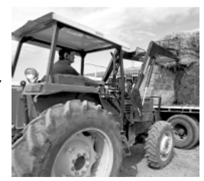
Figure 4. Tractor fitted with a FEL, specifically designed for loading/unloading hay bales.

FELs should be supplied with a support stand which places the arms at the correct height to allow the tractor to be driven in or out when connecting or disconnecting the arms. The support stand should be located on a firm level surface capable of supporting the weight of the unhitched FEL.