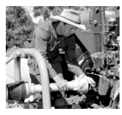
Figure 1. Tractor being fitted with PTO guard.